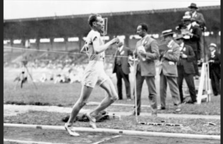
Paavo Nurmi wins the 1500m in Paris 1924