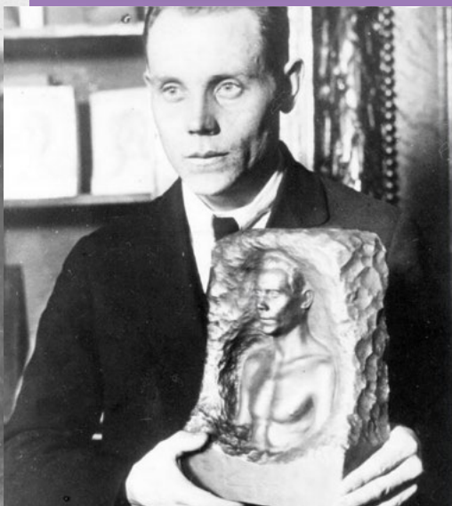
Paavo Nurmi wins the Paris 1924 cross country race