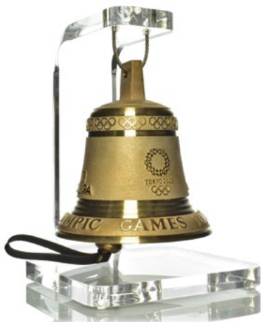
Tokyo 2020 last lap bell