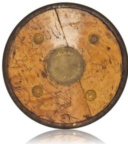
Helsinki 1952 pool discus