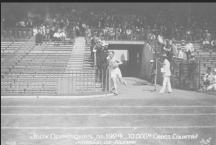
Paavo Nurmi enters the Olympic stadium to win the Paris 1924 cross country race