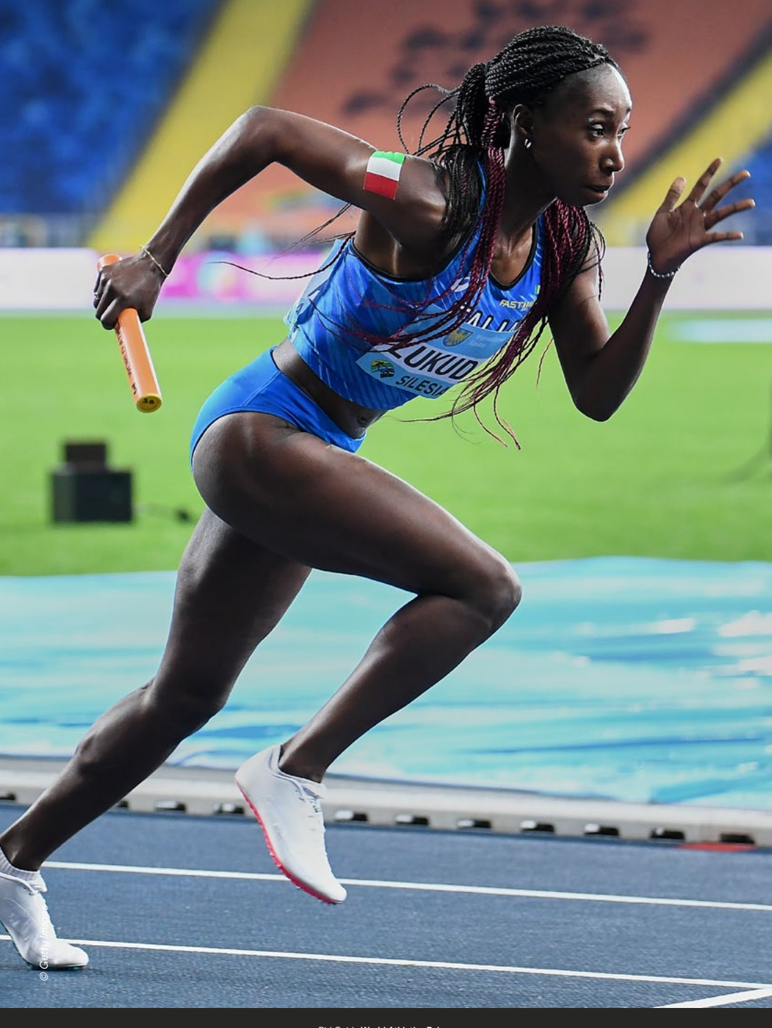
Bid Guide World Athletics Relays